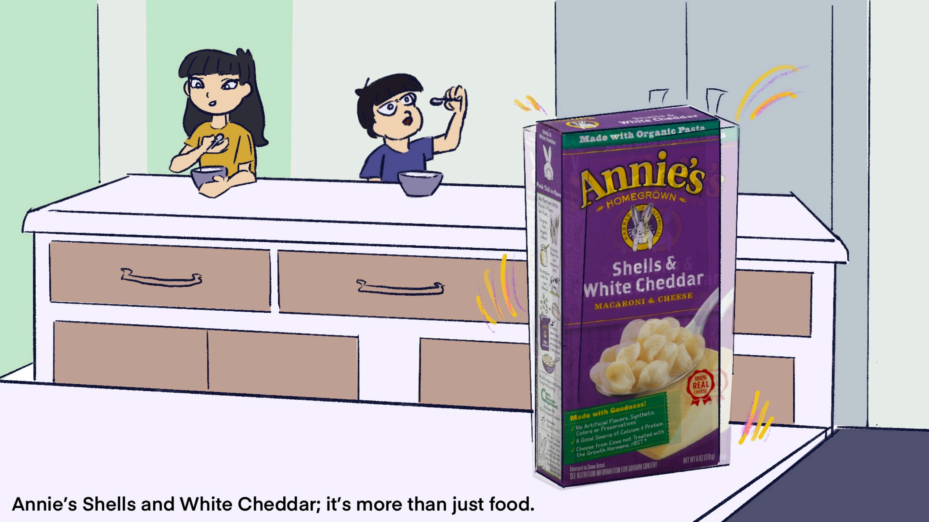
Annie's Shells and White Cheddar; it's more than just food.